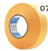
07 Masking Tape