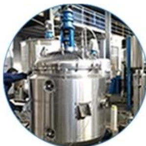
Creaming Machine Line