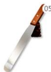
05 Stirring Knife