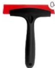
04 Rainbow Scraper