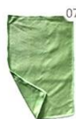
07 Scouring Pad