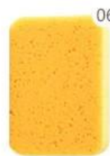
06 The sponge