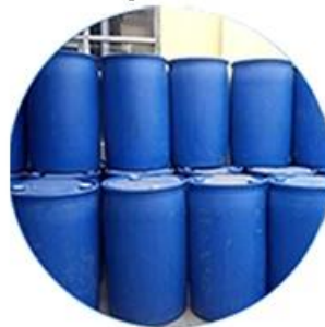
Real Material Stock