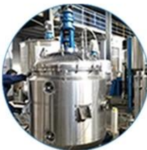
Creaming Machine Line